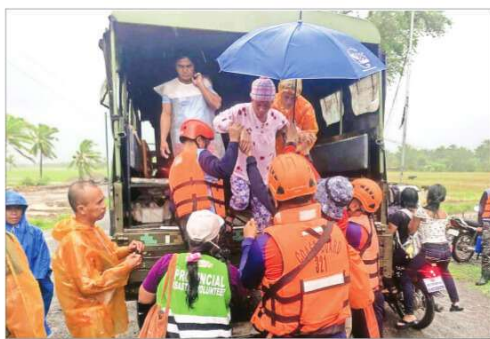
Rescuers evacuate residents in Occidental Mindoro province of the Philippines as Typhoon Fung-wong batters the country on Sunday

A villager drowned in flash floods in the eastern province of Catanduanes and another in Cebu, a designation adopted years ago to underscore the urgency tied to more